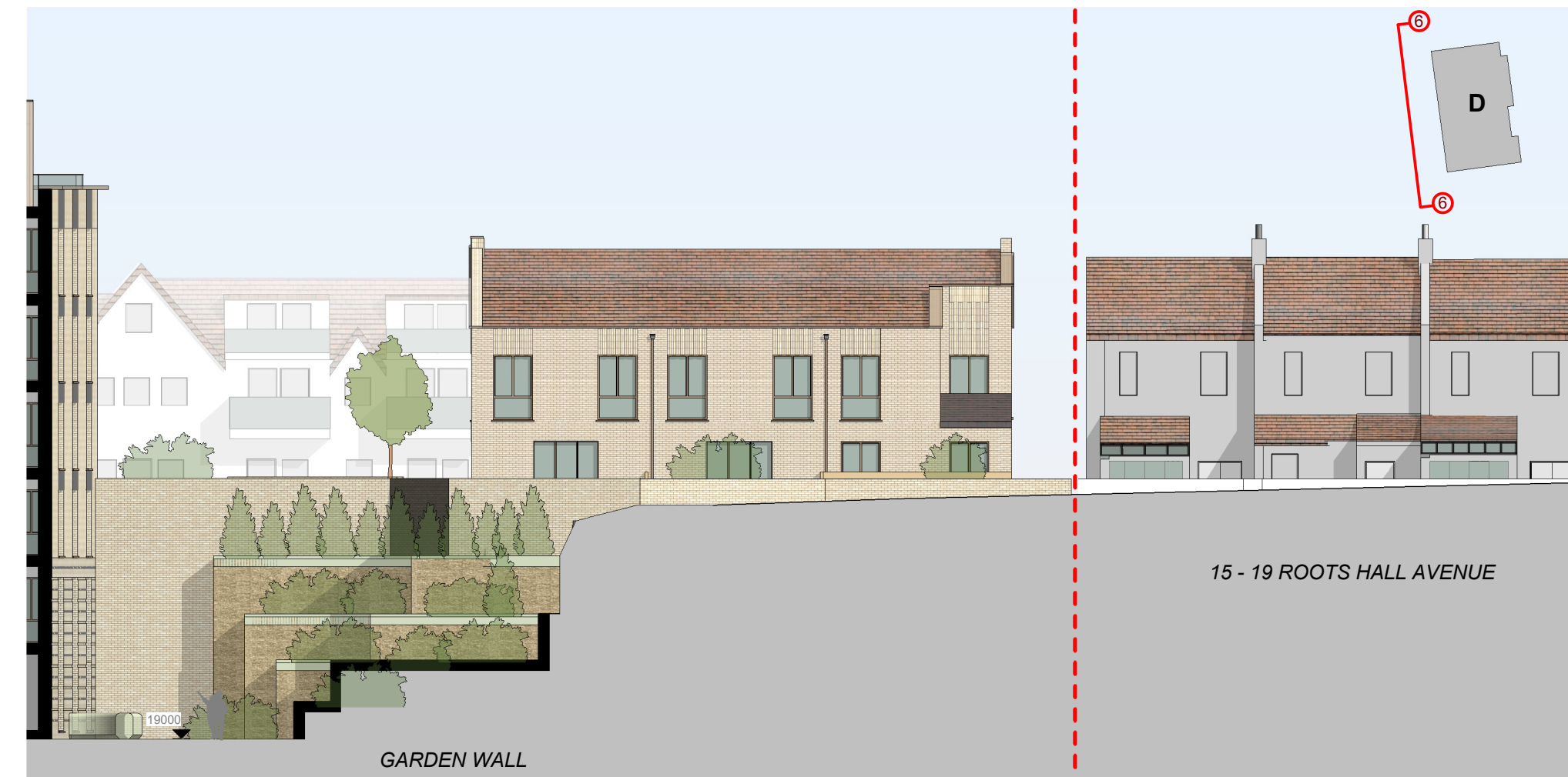
4 West Elevation 1:200