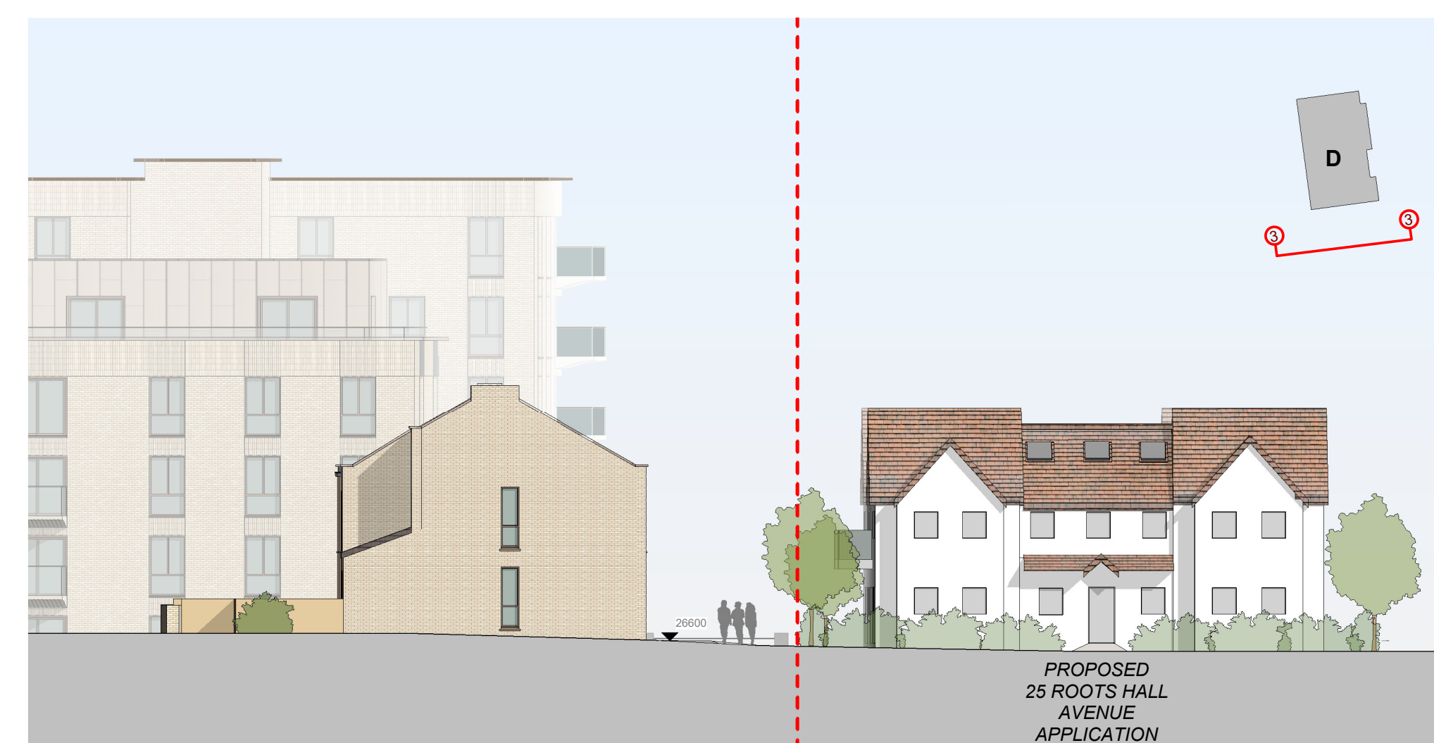
2 South Elevation 1:200